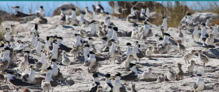
Crested terns nesting on a WA island.

Leave nothing but footprints, take nothing but photographs and memories.