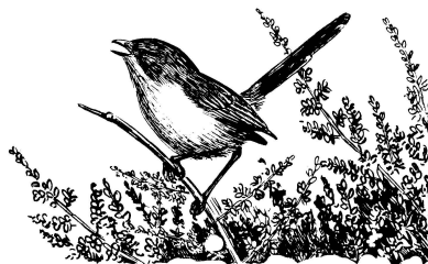
Thick-billed Grasswren The western sub-species is classified as vulnerable and now only found on the fringe of its former range.

should be Bar-tailed Godwit, Common Greenshank, Pied Oystercatcher, Grey Plover, Lesser Sand Plover, Greater Sand Plover, Red-capped Plover, Red-necked Stint, Curlew Sandpiper, Ruddy Turnstone and a possible Terek Sandpiper. There could also be Silver Gull, Caspian Tern, Crested Tern, Fairy Tern and possibly Pacific Gull and Lesser Crested Tern. You might also see Little Egret or Eastern Reef Egret.