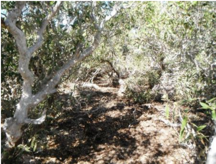
Plate 1 Coastal mangrove sites and locations where black rats were detected on camera traps at New Beach south of Carnarvon