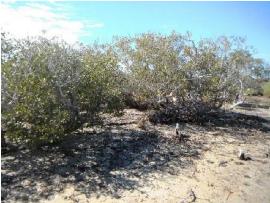
Camera 080 New Beach 2, 25.14159°S 113.77592°E.