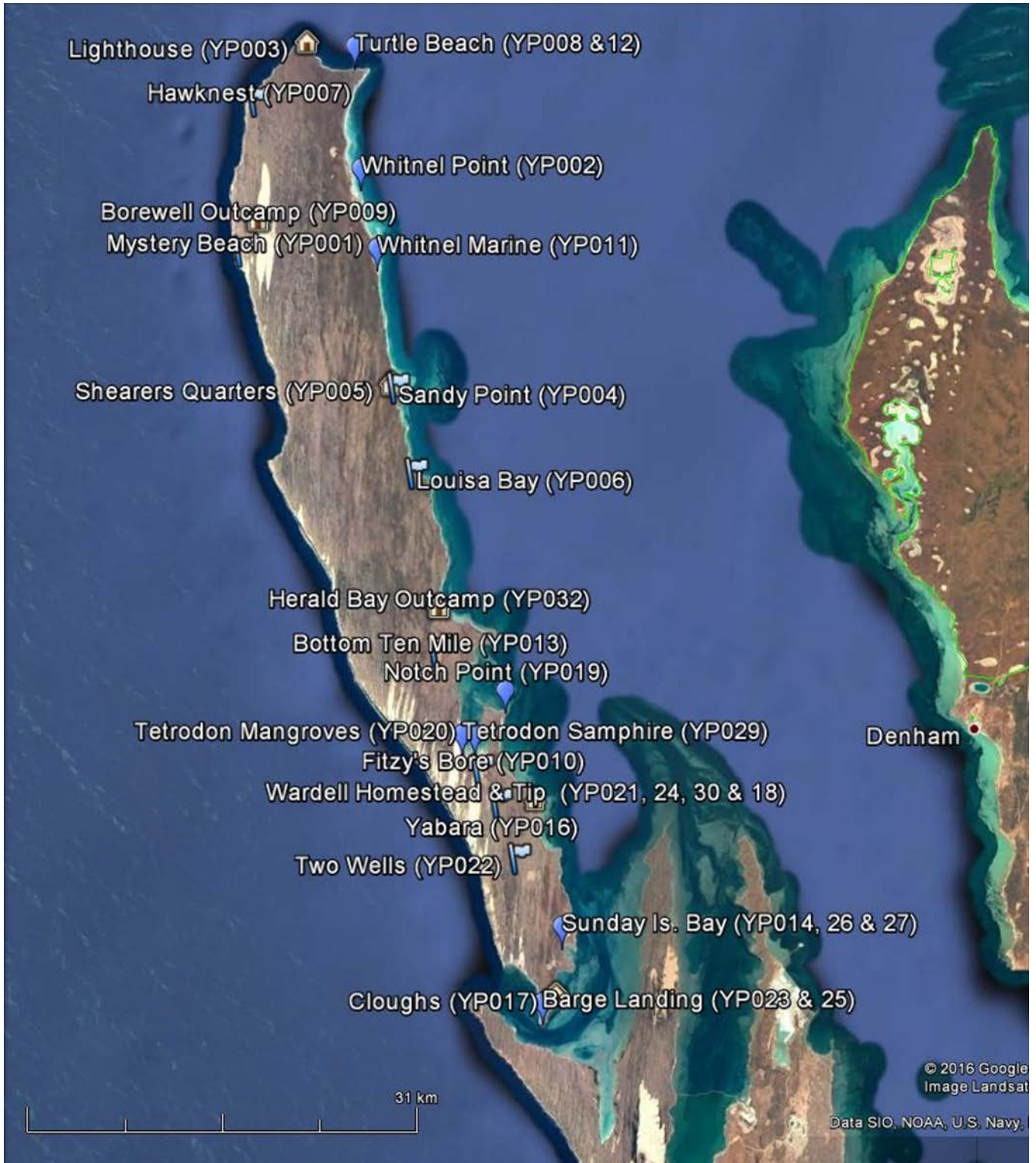
Figure 2 Location of camera trap sets on Dirk Hartog Island.