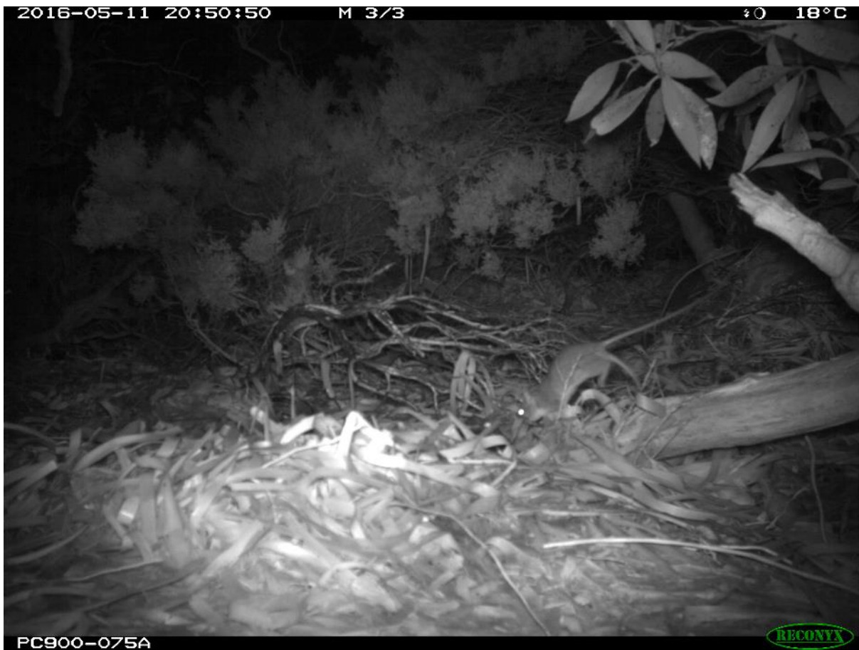
Camera trap image of a black rat ( Rattus rattus ) at New Beach south of Carnarvon (Gary Hearle)