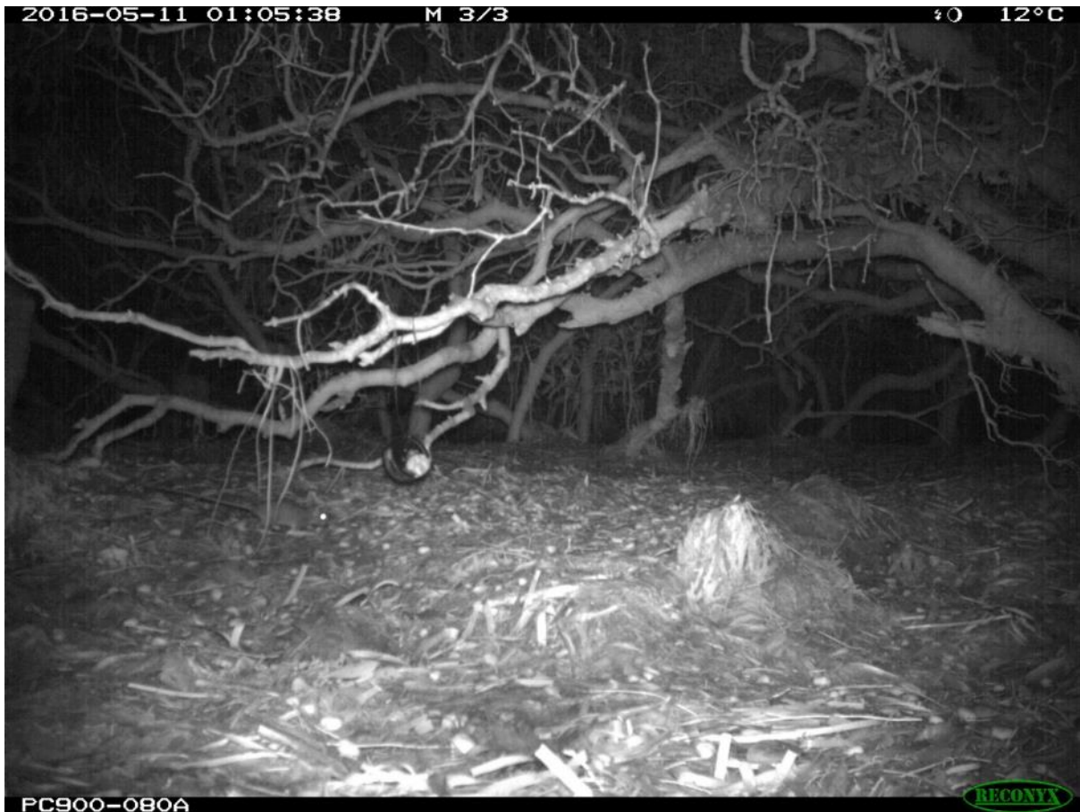
Plate 2 Black rat on Camera trap 80A at New Beach south of Carnarvon