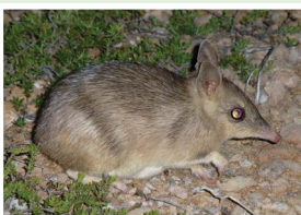
Shark Bay bandicoot