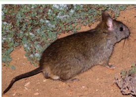
Greater stick-nest rat