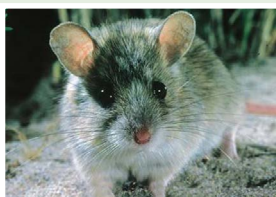
Shark Bay mouse